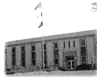
CEDAR COUNTY, IOWA

CEDAR COUNTY BOARD OF SUPERVISORS Cedar County Courthouse 400 Cedar Street, Tipton, IA 52772 Tel 563-886-3168 Fax 563-886-3339 bos@cedarcounty.iowa.gov www.cedarcounty.iowa.gov